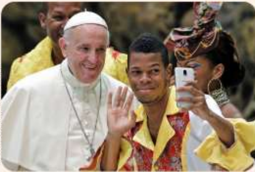
ONE PHOTO / MAXIMUM SECURITY